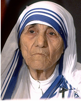
St. Mother Teresa of Calcutta