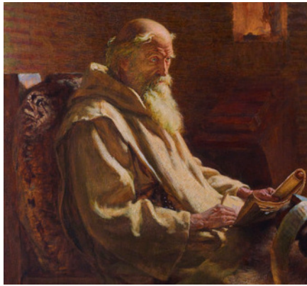
St. Bede the Venerable